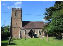
St Bartholomew's Redmarley