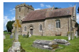
St John's Pauntley