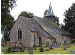
St Mary's Donnington