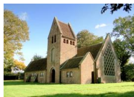
St Edward's Kempley