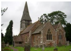
St Mary's Bromesberrow