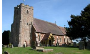
St Anne's Oxenhall