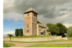
St Mary's Upleadon