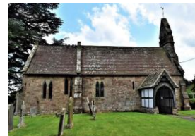
St John's, Preston