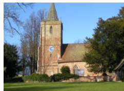
St Mary's Dymock